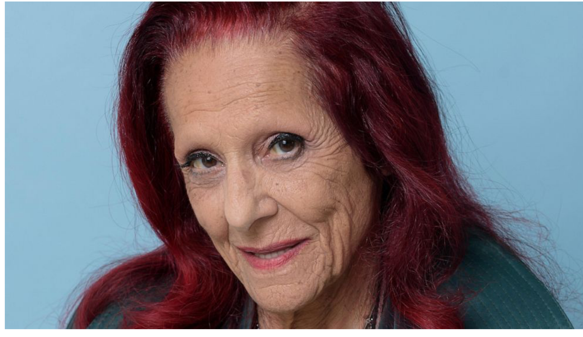
Patricia Field poses for a portrait on Wednesday, June 7, 2023, in New York to promote "Happy Clothes: A Film About Patricia Field," which premiered at the Tribeca Film Festival.

NEW YORK -- Costume designer Patricia Field has never liked fashion rules.