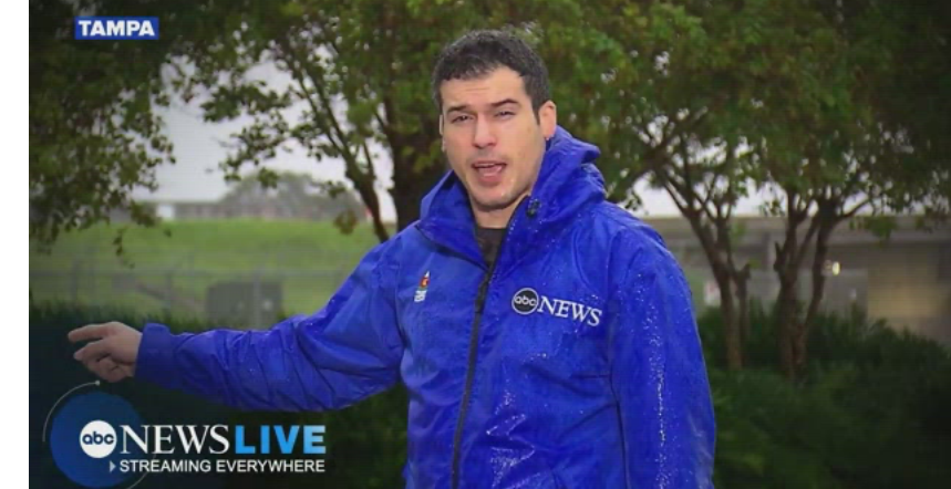
24/7 coverage of breaking news and live events